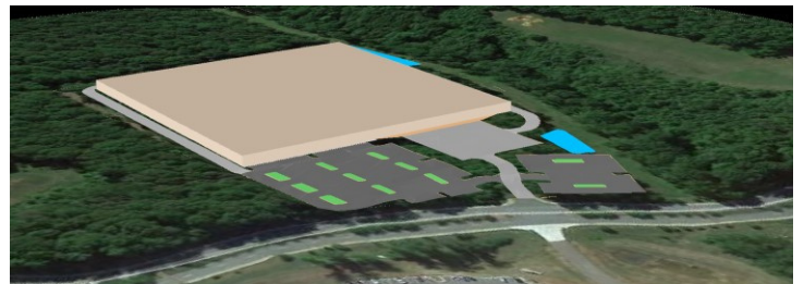
Example of a 200,000 sq. ft. building lot layout.