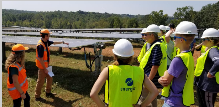
Bedford County high school students toured the Solar Farm in Bedford this month to learn about the power generated by the sun for the Town.

Bedford County celebrates 10 years of connecting local businesses with a young workforce through its Bedford ONE (Offering New Experiences) program. Over the years, more than 4,000 high school students have toured area companies to learn about career pathways and job opportunities, as well as education and training needs for various careers.