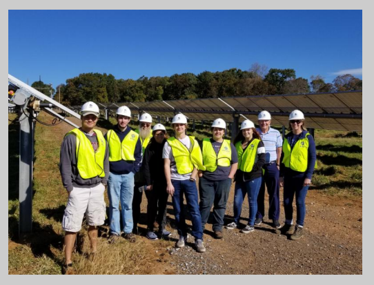
BCPS students learned about solar energy at the Bedford Solar Farm.

Farm is operated by O2 EMC, out of Charlotte, NC, provide energy to the Bedford.. The students really enjoyed this tour and learned about solar energy and all of the career pathways in this industry, from finance to business development, and legal to engineering.