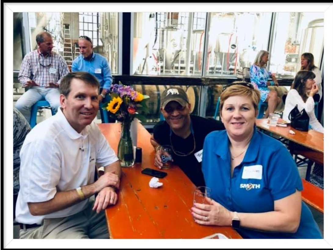
Representatives from Smyth and Bison Printing enjoying the evening at Beale's.

Thank you to all who came out to enjoy the tacos and beverages at our annual business appreciation event at Beale's. We had 60 people attend the May 16 event which was sponsored by the Bedford County Economic Development Authority.