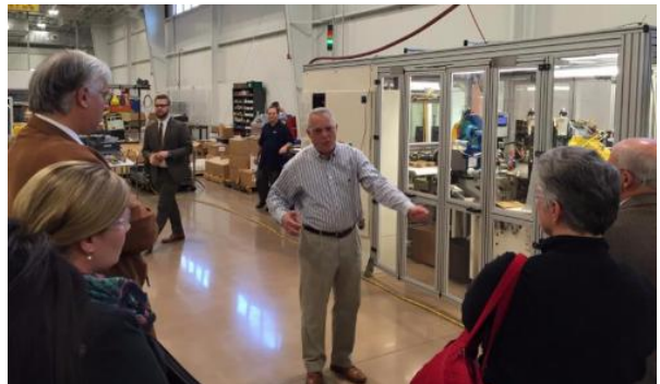
The December Roundtable meeting was held at Simplimatic and was followed by a tour.

Please plan to attend each of these events to stay connected with the county and business community! We will keep you updated as more event details emerge.