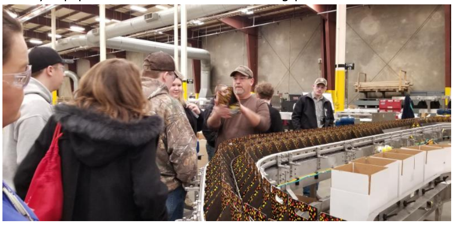
Students at Sentry Equipment watched conveyor systems in action.

At the end of the tour, students were treated to a pizza lunch by the company and watched an <u>Ultimate Factories video</u> that features Sentry Equipment in the Coca-Cola bottling plant in Louisiana.