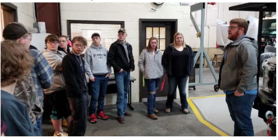
BCPS students tour Custom Truck One Source.

Custom Truck serves the forestry and power industries among others, and customizes vehicles such as bucket trucks that can be used to trim trees or work on power lines.